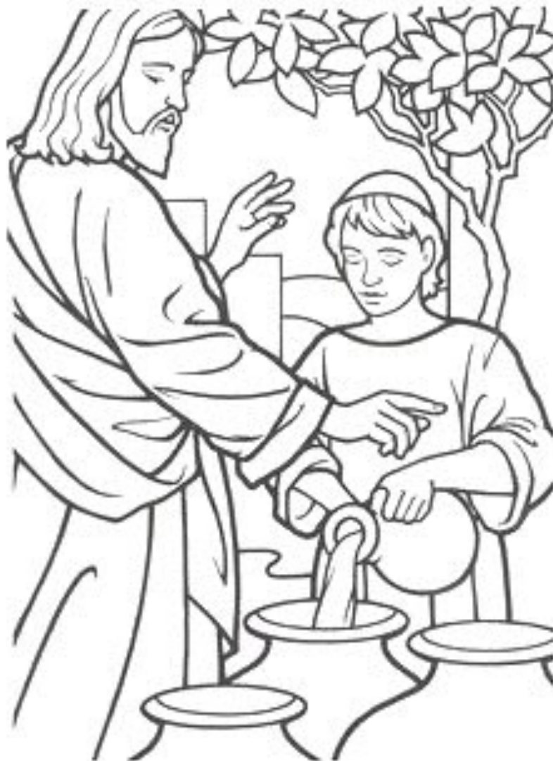
JESUS TURNS WATER INTO WINE

John 2:11 "And his disciples believed in him"