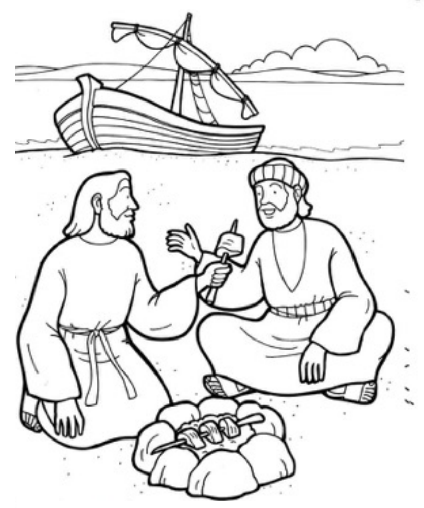
JESUS COOKS BREAKFAST FOR THE DISCIPLES

1 Peter 4:10 "God has given each of you a gift from his great variety of spiritual gifts. Use them well to serve one another."