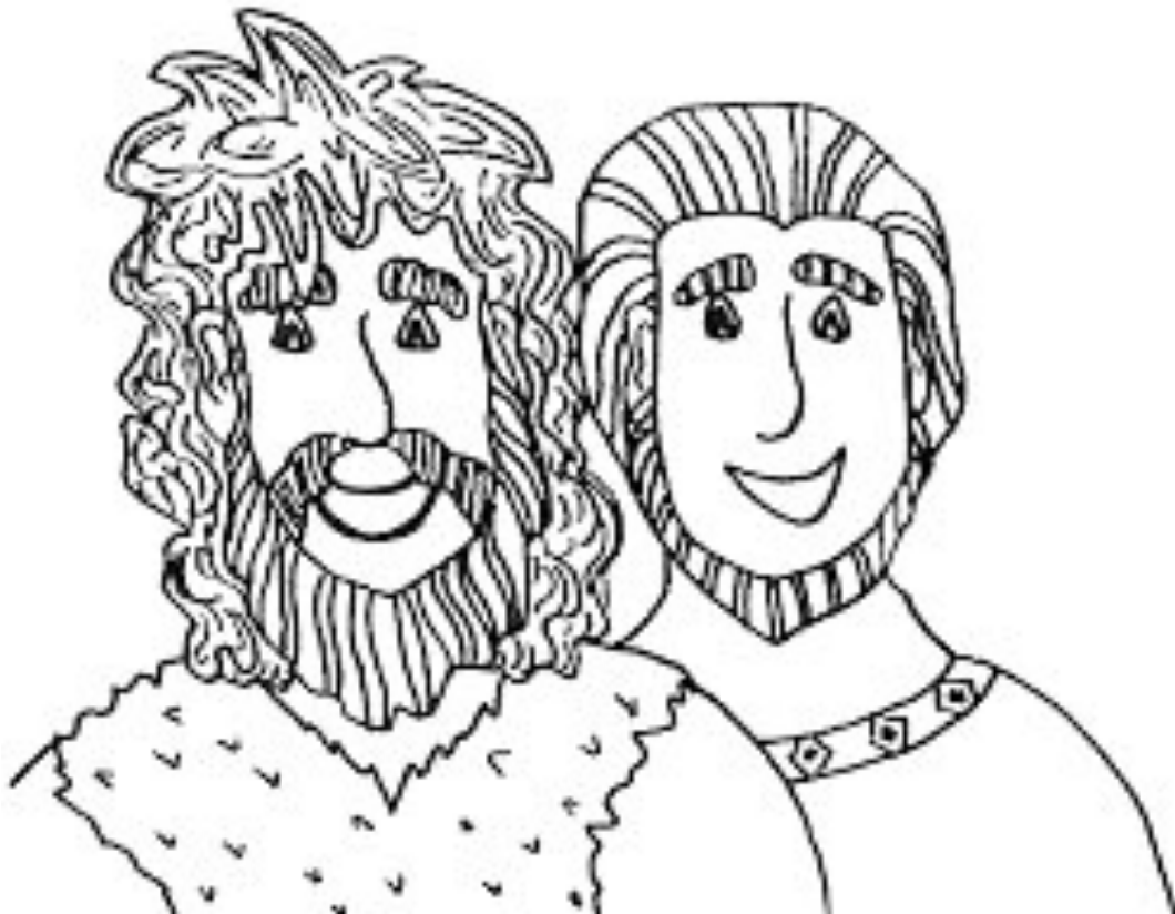
JACOB AND ESAU

Proverbs 25:28 "A person without self-control is like a city with broken-down walls."