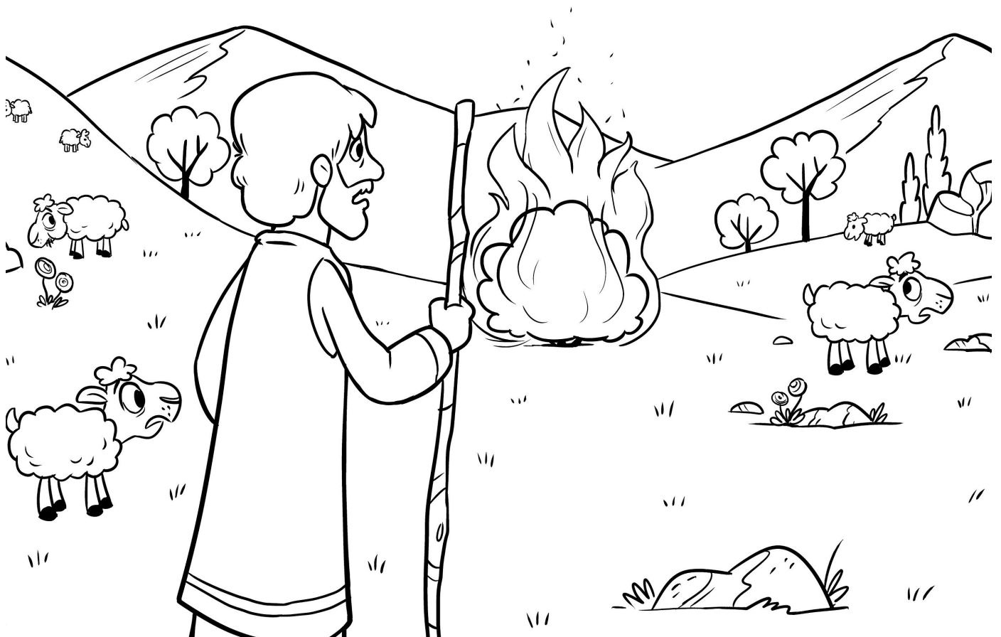
MOSES AND THE BURNING BUSH

Exodus 3:14 "God replied to Moses, "I Am Who I Am. Say this to the people of Israel: I Am has sent me to you."