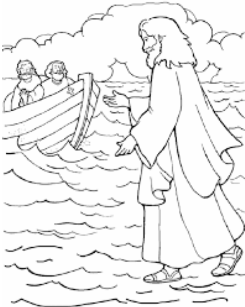
JESUS WALKS ON WATER

Matthew 14:27b "Don't be afraid," he said. "Take courage. I am here!"