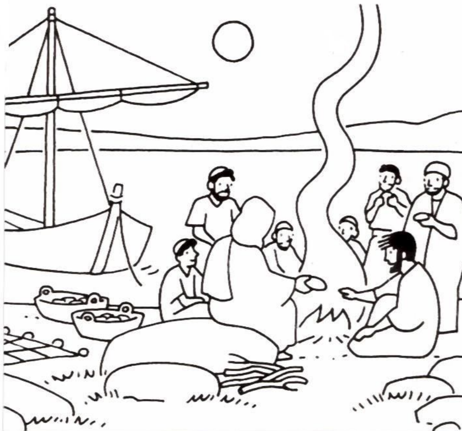
JESUS AND HIS DISCIPLES

1 Peter 4:10 "God has given each of you a gift from his great variety of spiritual gifts. Use them well to serve one another."