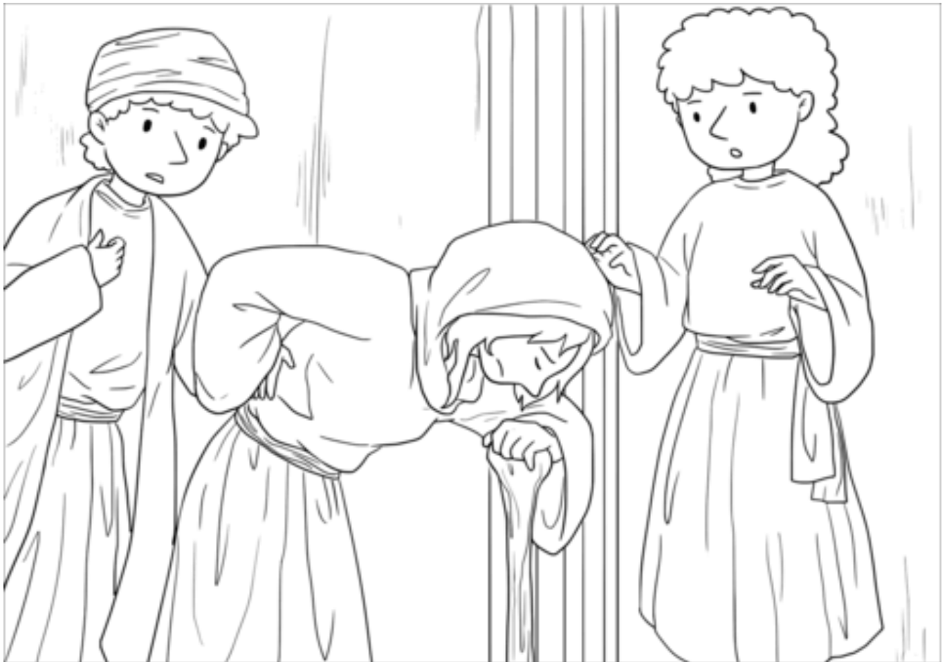
JESUS HEALS A WOMAN ON THE SABBATH

Mark 2:27 "The Sabbath was made to meet the needs of people, and not people to meet the requirements of the Sabbath."