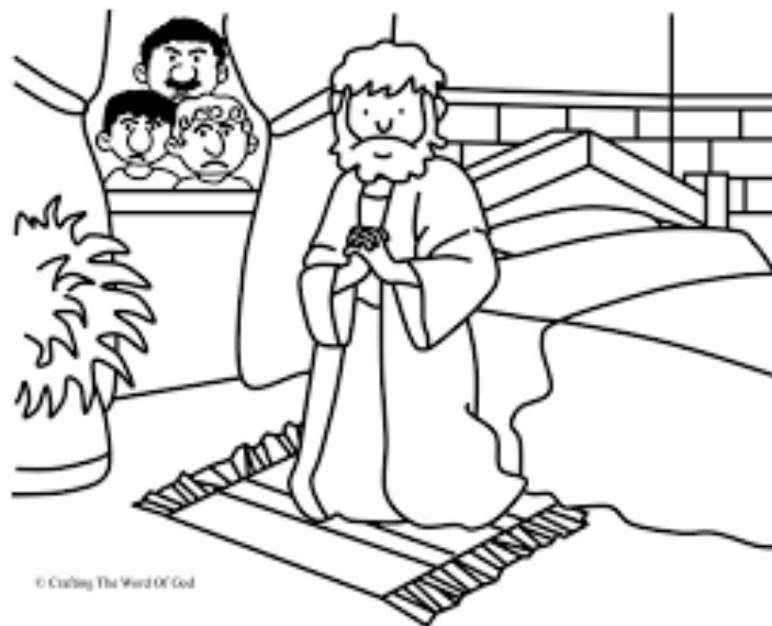
© Crafting The Word Of God

Deuteronomy 4:____ "Be _____ never to forget what _____ yourself have _____."