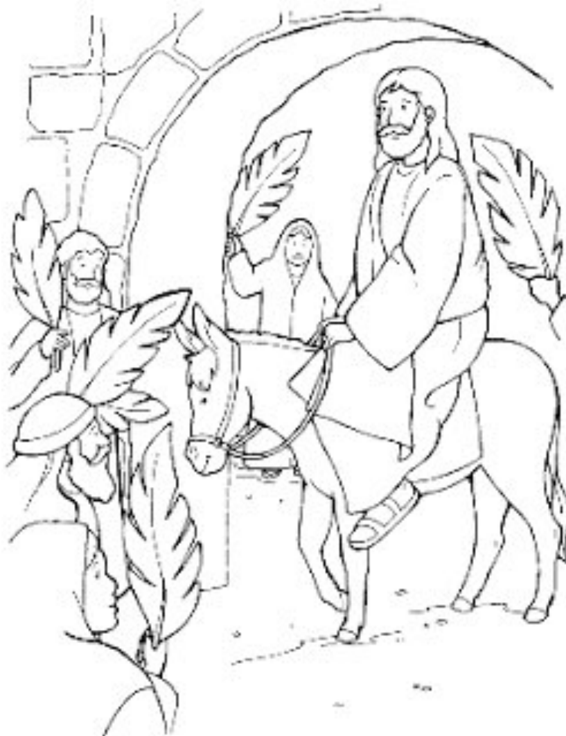
JESUS RIDES INTO JERUSALEM ON A DONKEY

Luke 19:40 "If they kept quiet, the stones along the road would burst into cheers!"